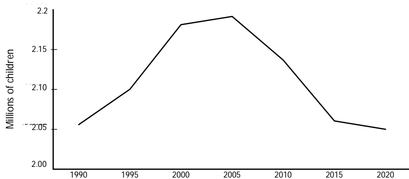
EXHIBIT 2. Michigan School-Age Population, 1990–2020 (projected)

SOURCE: Office of the State Demographer.